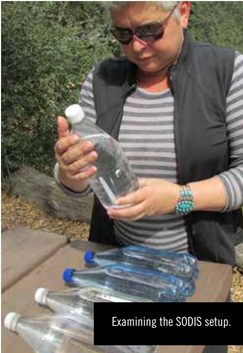
Examining the SODIS setup.

Rainwater harvesting or boiling is recommended during these days