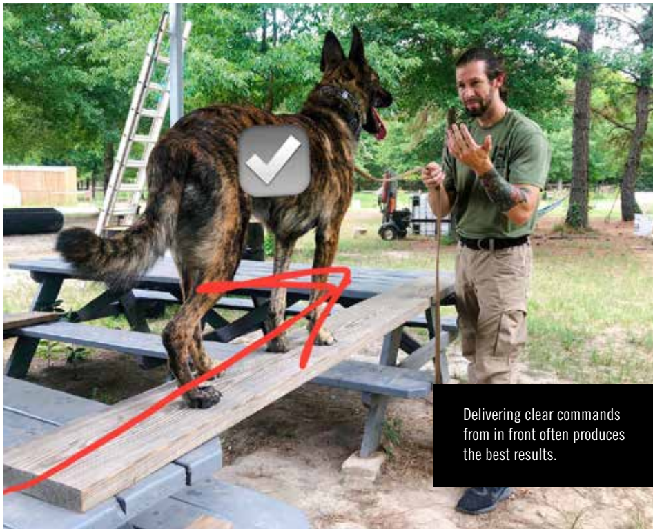
Delivering clear commands from in front often produces the best results.

ing a beam towards their human, rather than the human standing stationary at the beginning of the beam and having the dog away from the handler to cross the beam without the handler in sight.