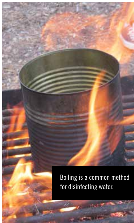
Boiling is a common method for disinfecting water.

Fire is your best way to kill all the biological contaminants that might be in your water. You just need a pot and the ability to get a fire going to boil your water. How long must you boil it to kill all organisms? Since everything that gets you sick is dead at 160 to 170 degrees F, your water is generally