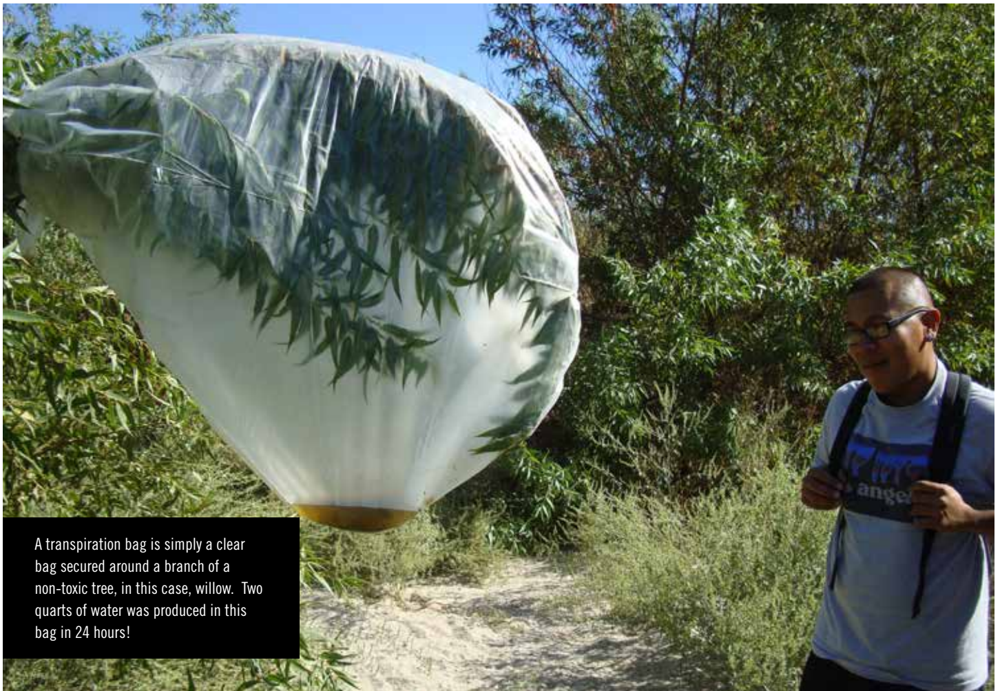
A transpiration bag is simply a clear bag secured around a branch of a non-toxic tree, in this case, willow. Two quarts of water was produced in this bag in 24 hours!