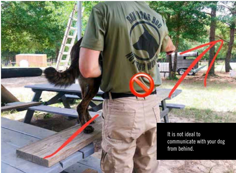
It is not ideal to communicate with your dog from behind.

sit!” but only actively while they are sitting.