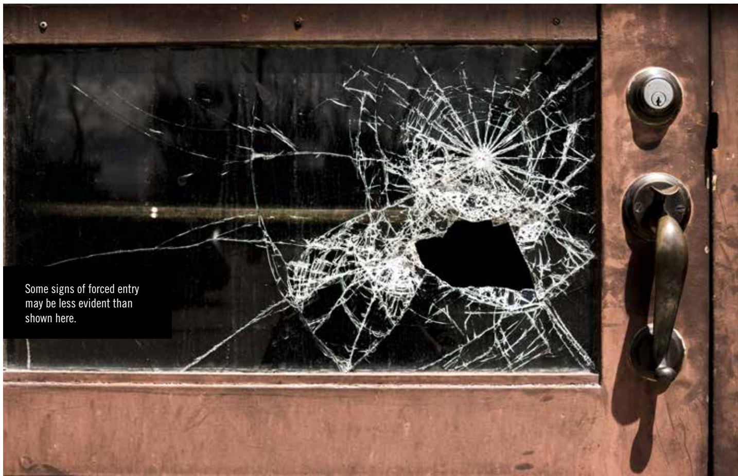
Some signs of forced entry may be less evident than shown here.

sessing potential threats: baseline + anomaly = decision. The baseline is what's normal for any given situation. The anomaly is something that has been added or removed from a situation. The decision is what action you take in response to the anomaly.