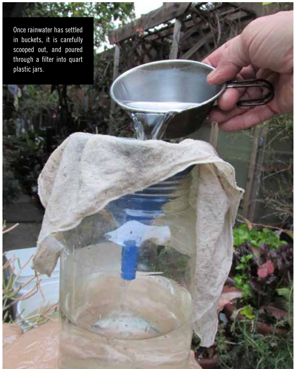
Once rainwater has settled in buckets, it is carefully scooped out, and poured through a filter into quart plastic jars.